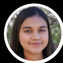
Gitanjali Rao Founder of the Global Sunrise Project

Inspiring individuals with a strong passion for environmental sustainability who help spread the word about and enhance the impact of The Earth Prize competition.