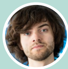
Boyan Slat Founder of The Ocean Cleanup