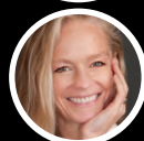
Suzy Amis Cameron Environmental advocate and author of The OMD Plan